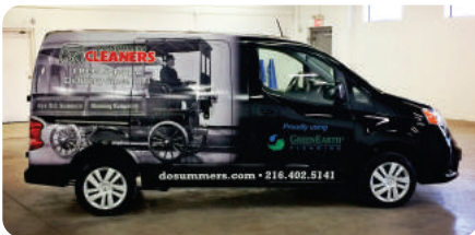
D.O. Summers Cleaners Nissan NV Full Wrap

For example, companies with large fleets often have vehicles of various makes, models and years vehicles spread throughout the United States and require installation at numerous locations. VMS has access to a nationwide network of installers that allow VMS to provide a full turnkey fleet graphics solution at every location.